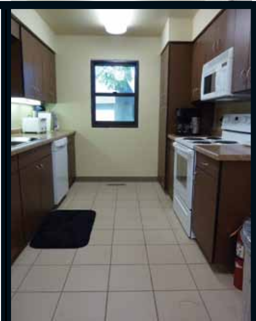
Thatcher Cottage kitchen, post-renovation