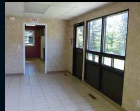
Butt Cottage dining area, pre-renovation