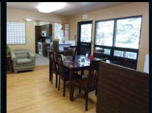
Thatcher Cottage dining area, post-renovation