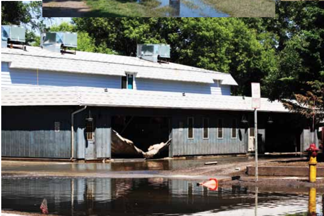
Minot area flood of summer 2011 Clockwise from bottom left: Minot Community youth Home, Wildlife area and Orchard, Wildlife sign, clay dike behind cottage, staff monitoring the dike on campus.