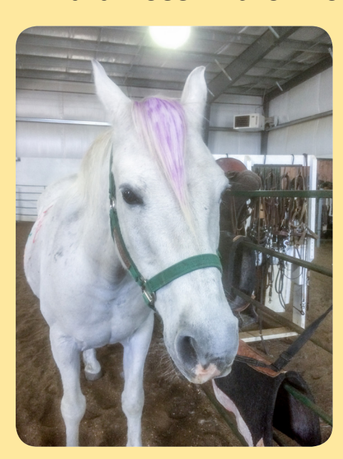
Ranch kids learn to be mindful and relaxed as they paint their horses.

Painting on their horses is one of our kids' favorite projects, a project designed to help them practice mindfulness. While they are painting (with paint that is safe for the horses) we ask them to think about how their horse makes them feel, or how they feel about their horse.