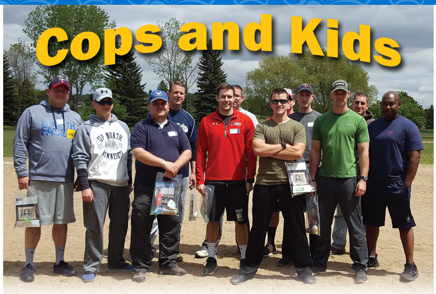
Spending time with police officers teaches our kids that police officers are the good guys.

Police officers from Ward County Sheriff's Office, Minot Police Department, McLean County Sheriff's Office, and the North Dakota Highway Patrol played softball with Ranch kids and staff on Fun Day, an event we hold for our kids the day after the last day of school. We didn't tell the kids our guests were police officers until the end of the game, and the looks on their faces when the officers introduced themselves was priceless.