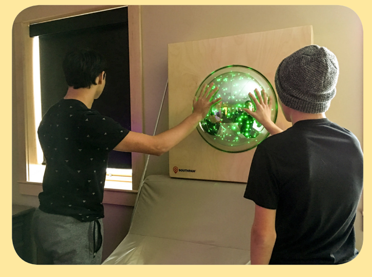
Trauma-informed tools and strategies help youth achieve their treatment goals."

Through their support, Lutheran Church Missouri Synod, (LCMS), is furthering the mission of the Ranch and changing children's lives!