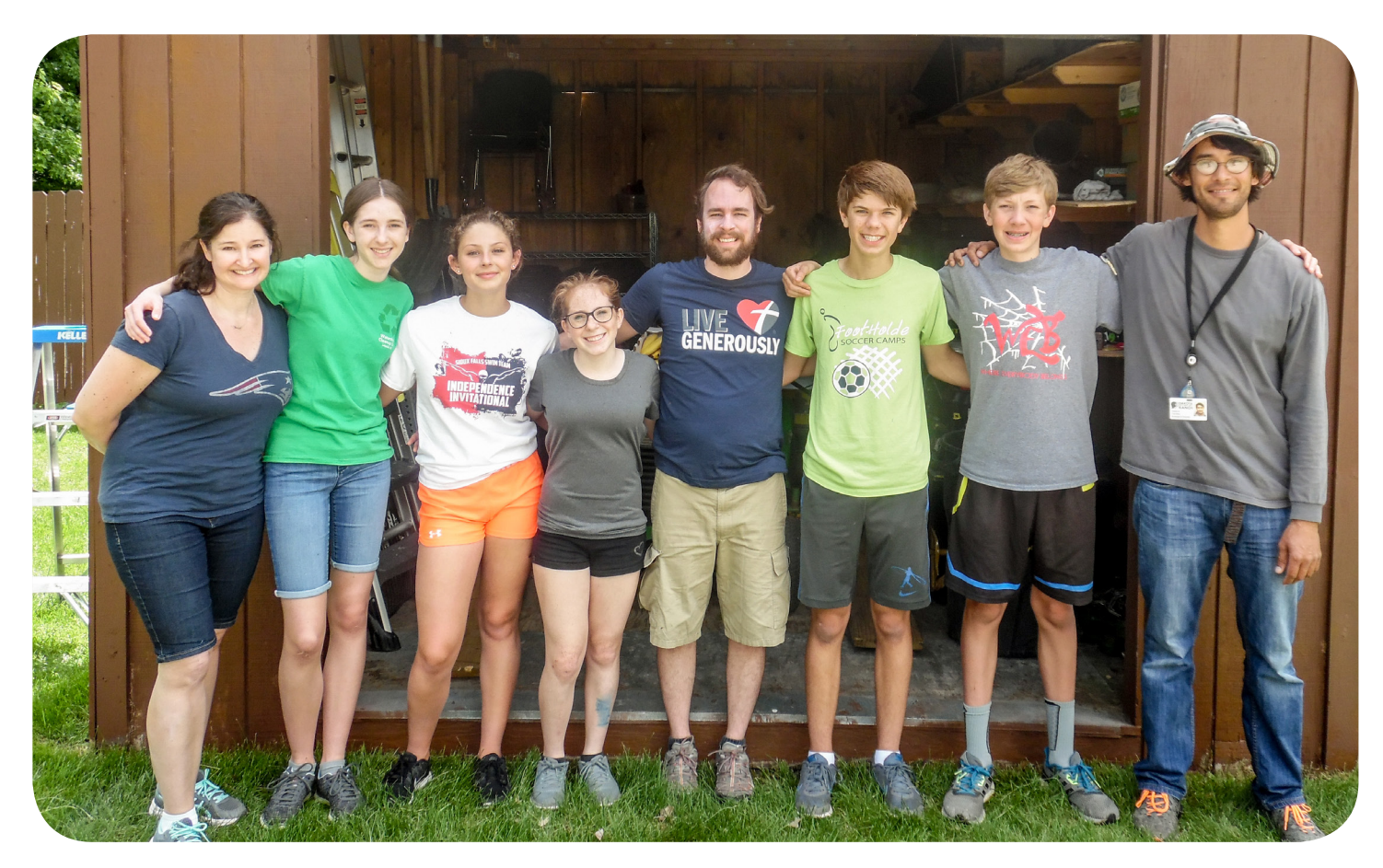
Students from Messiah Lutheran Church, Lakeville, MN, repainted the sheds at the Fargo Youth Home.

We have two more Servant Teams arriving in late July—too late to make this issue of the Ranch Voice. Watch for stories and photos of Servant Teams from Columbia, MO, and Wayne, NE, in our Winter issue.