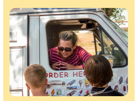
Ice cream truck brings "normal" summertime experience to our Ranch kids.

At 2 p.m., every other Friday all summer, Ranch kids hear the sound of ice cream truck music, and then see the truck drive onto the Minot campus. Just like every other kid in every other neighborhood in America, they run up to the truck, money in hand, to purchase tasty ice cream treats!