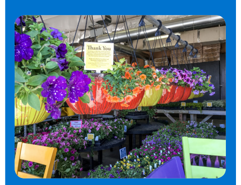
Thrivent Action Teams take their generosity into the community.

In addition to directing dollars through Thrivent Choice, Thrivent Financial encourages members to create Thrivent Action teams. In May, a Thrivent Action Team, led by a Thrivent member and other volunteers, helped at the Ranch's annual BLT Day. Thrivent provides a $250 Community Impact card as seed money to jumpstart the project and purchase the necessary