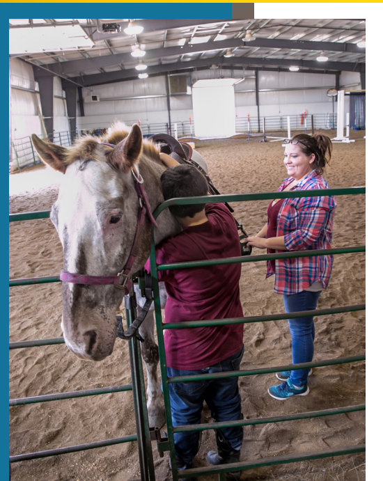
Children often feel so safe with their horse that they are able to open up and share their pain.

"I don't know where I'd be without my horse. He helped me when I thought I couldn't cope with life."